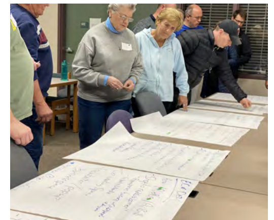
Residents voting for their top priorities during one of the Comp Plan Town Hall Meetings.