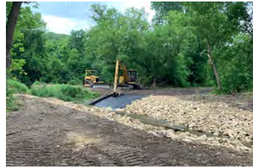
A portion of the Isabelle Creek bank was shaped and rip-rapped this summer.

The current state of our sidewalks ranked as one of the top concerns by residents during our Comp Plan feedback sessions. The Village installed 2159 square feet of new sidewalk in 2022, with more planned for 2023!