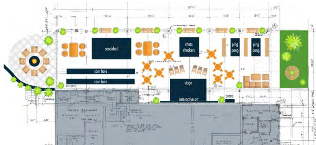
Concept drawing for placemaking space (under former drive-thru) for the Vibrant Spaces Grant.

It was recommended in our Comprehensive Plan to consider hosting an annual 'Community Summit' to bring together the Village and local organizations to discuss issues and opportunities, identify projects to partner on and work towards, review Comp Plan progress, etc. We hope to plan our first summit meeting sometime this Spring. You all will be invited so watch for more details.