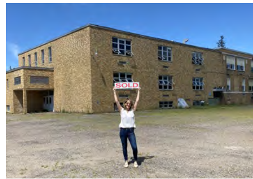
Village of Ellsworth purchased the blighted old junior high property with ARPA funds in August.

After six hundred survey responses, three